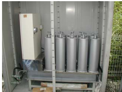
One MB systems is installed at each station