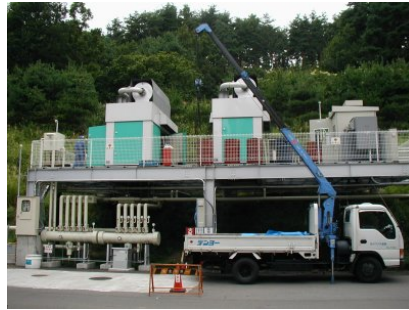
Diesel Generation Station #1