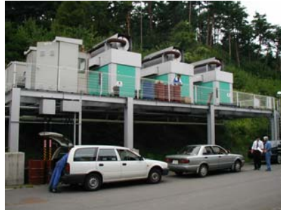
Diesel Generation Station #2